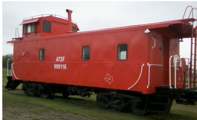
Above: 5/23/2015 Santa Fe Caboose at Saginaw, Texas .