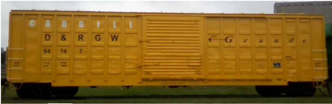
Above: 5/23/2015 New boxcar at Saginaw, Texas.