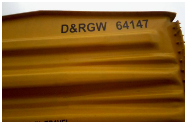
Above: 5/23/2015. End logo from Denver and Rio Grande Western boxcar at Saginaw, Texas.

Programs subject to change without notice. More programs may be announced at the event. We welcome anyone who would like to show off their stuff. Just bring it!