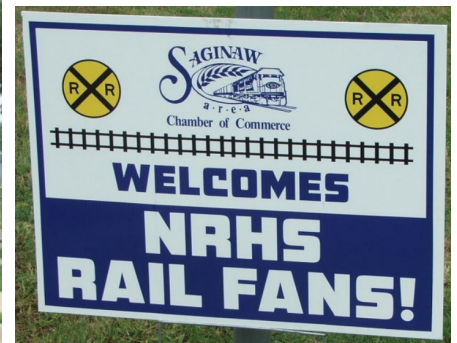
Above: Saginaw depot all ready for visitors. The sign says it all – welcome!