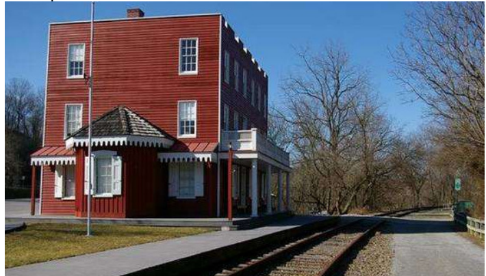
(Above right) PRR/Northern Central station, Hanover JCT, PA. Starting in 2013, plan is for a brand new replica 4-4-0 steam locomotive** to begin tourist operation from New Freedom, PA through here. Feb. 9, 2013 (**see York #17 article on p. 2)