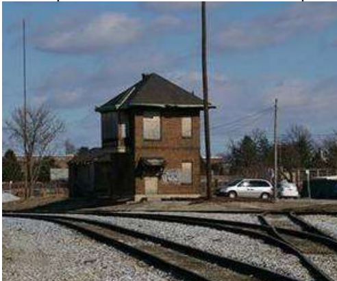
(Above left) PRR Tower, York, PA. Site is for sale. Expect this is last picture I take of it. Feb. 9, 2013