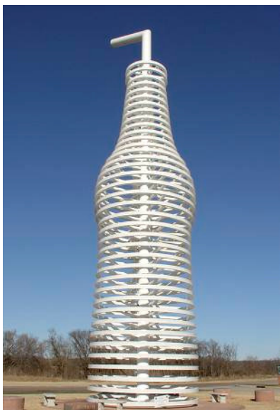
Above: Pop's Soda (and gas), a new, already famous Route 66 icon, east of Oklahoma City.

A good part of the trip felt like we took a trip back in time. We even stayed in historical hotels in OKC and Tulsa that were built prior to when Route 66 was even conceptualized. This trip on the mother road was my historical automobile experience.