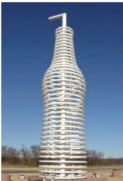
Above: Pop's Soda (and gas), a new, already famous Route 66 icon, east of Oklahoma City.

A good part of the trip felt like we took a trip back in time. We even stayed in historical hotels in OKC and Tulsa that were built prior to when Route 66 was even conceptualized. This trip on the mother road was my historical automobile experience.