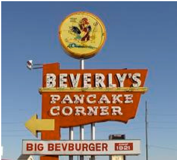
Above: Beverly's Pancakes, route 66 icon, Northwest Highway, Oklahoma City.

During the heyday of rail travel, which includes the decades of the 30's and 40's, automobile travel was starting to come into its own to start competing with the railroads. In my mind, there were two major reasons for this. First, automobiles were becoming more affordable and the famous "Route 66" was allowing families to take fun and exciting car trips through a large segment of America. This summer, my family and I spent four days and three nights following the old Route 66 from Oklahoma City to Tulsa. We tried to visit as many existing structures from this bygone era as possible.