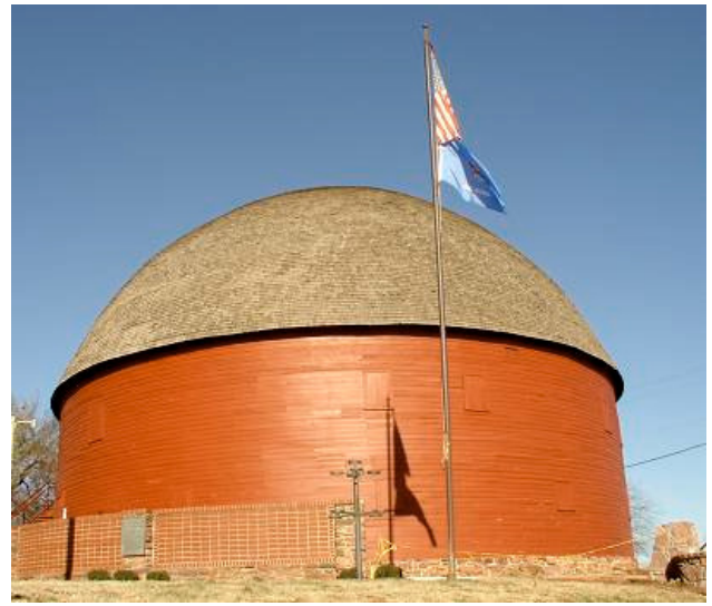
Above: Round Barn, class Route 66 landmark, east of Oklahoma City.

A good part of the trip felt like we took a trip back in time. We even stayed in historical hotels in OKC and Tulsa that were built prior to when Route 66 was even conceptualized. This trip on the mother road was my historical automobile experience.