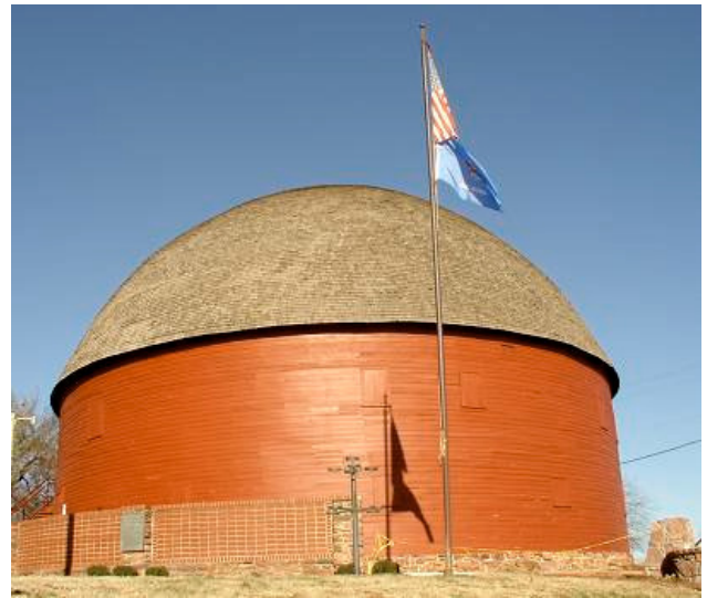
Above: Round Barn, class Route 66 landmark, east of Oklahoma City.

A good part of the trip felt like we took a trip back in time. We even stayed in historical hotels in OKC and Tulsa that were built prior to when Route 66 was even conceptualized. This trip on the mother road was my historical automobile experience.