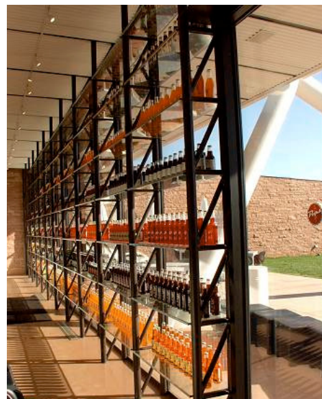
Above: Rainbows on Route 66, the many colors and flavors of Pop's Soda, east of Oklahoma City. (VH)