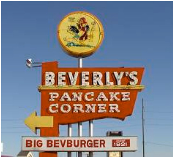
Above: Beverly's Pancakes, route 66 icon, Northwest Highway, Oklahoma City.

During the heyday of rail travel, which includes the decades of the 30's and 40's, automobile travel was starting to come into its own to start competing with the railroads. In my mind, there were two major reasons for this. First, automobiles were becoming more affordable and the famous "Route 66" was allowing families to take fun and exciting car trips through a large segment of America. This summer, my family and I spent four days and three nights following the old Route 66 from Oklahoma City to Tulsa. We tried to visit as many existing structures from this bygone era as possible.