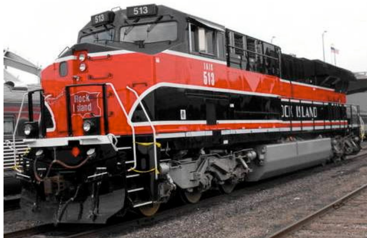
Above: ISIA #513 in Rock Island heritage colors

Vintage diesels were also on hand including an early Alco switch in Burlington Route colors, an F7A with Chicago North Western trim, and the Nebraska Zephyr which at one time operated between Chicago and Omaha and is now at the rail museum in Union, Illinois. The three large steam locomotives pulled excursions in eastern Iowa and western Illinois during the festival and the Nebraska Zephyr operated as a dinner train. A sizeable number of leased and private passenger cars were on hand including a group of Milwaukee Road cars with Hiawatha observation car which had also attended the 2009 NRHS convention in Duluth.