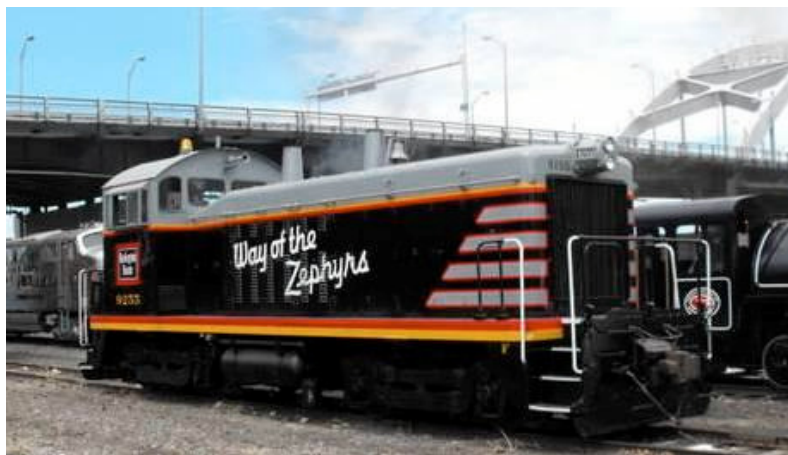
Above: Vintage switcher in Burlington Route colors