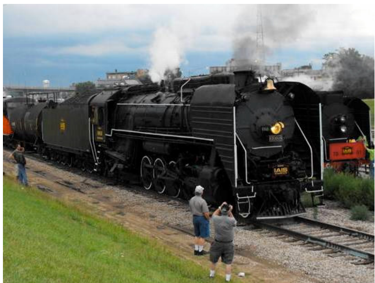
Above: IAIS Chinese built QJ class 2-10-2 locomotives. Americanized version has the single headlight.

Aside from viewing the rail equipment and making cab visits, the main activities of the festival were the train rides. Twice daily 2-hour trips were made over IAIS rails, former Rock Island trackage, via Davenport, Iowa to Walcott, Iowa using one of the OJ locomotives. The cars used on these trips were not air-conditioned so passengers were able to experience Midwest summertime rail travel as in the "old days".