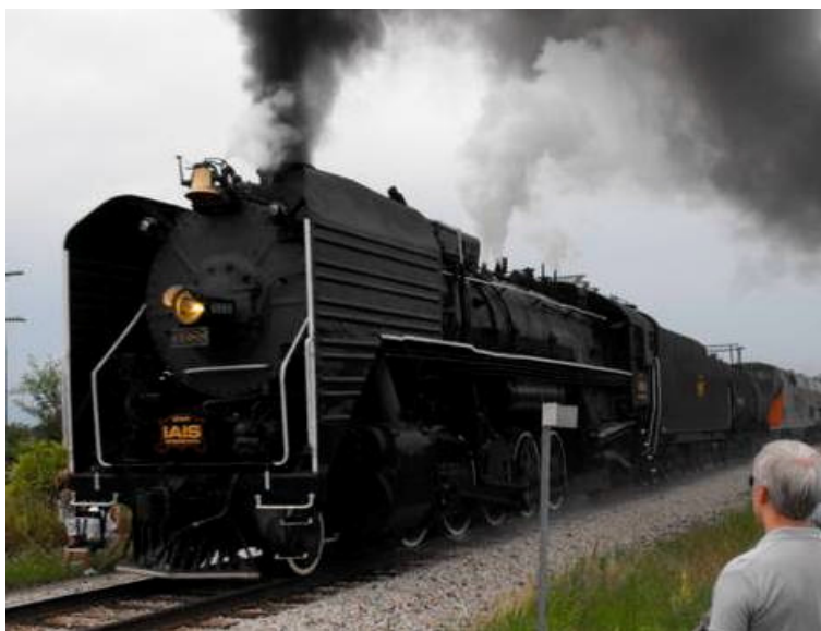
Above: #6988 does photo run-by at speed, West Liberty, Iowa

The two major trips were a day long 120 mile round trip to Bureau Junction, Illinois on the IAIS pulled by Nickel Plate #765 and a day long 90 mile round trip to Iowa City. The Iowa City trip was also over a former Rock Island route and was led by QJ #6988 which has been "Americanized" including the addition of a steam whistle that once worked on an Illinois Central mainline locomotive. On both trips two Amtrak P-42 locomotives in heritage markings provided support and head end power to the 16 car trains. Both trips including photo run-bys and operated on schedule. On the Iowa City trip I had the opportunity to visit briefly with Henry Posner, president of IAIS and owner of the QJ locomotives and a major sponsor of the festival. Other festival trips included the Rock Island Express from Chicago to Rock Island, which delivered the passenger cars and the Muscatine Flyer with a train ride down-river to Muscatine, Iowa followed by a riverboat ride on the Mississippi River back to Rock Island.