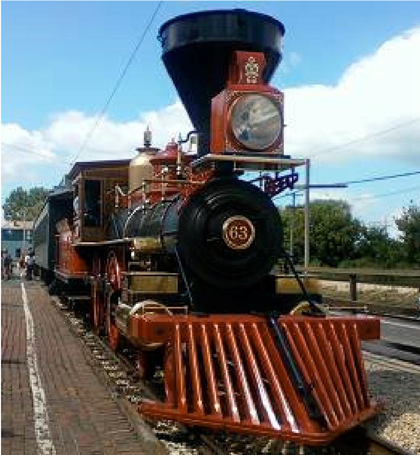
Above: Leviathan #63 in movement on IRM grounds, to meet up with coach consist.

During the morning hours today, repairs were completed on the air compressor and all required tests were completed and passed. August 13th was the first day that Leviathan has ever pulled coaches and passengers. Sunday August 14th operations included the Leviathan pulling coaches again with rides between 11:00am and Noon, and operations continued as required through late afternoon.