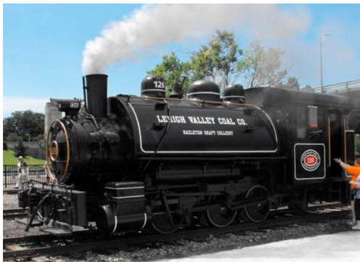
Right: Lehigh Valley Coal 0-6-0 Tank Engine

Aside from viewing the rail equipment and making cab visits, the main activities of the festival were the train rides. Twice daily 2-hour trips were made over IAIS rails, former Rock Island trackage, via Davenport, Iowa to Walcott, Iowa using one of the OJ locomotives. The cars used on these trips were not air-conditioned so passengers were able to experience Midwest summertime rail travel as in the "old days".