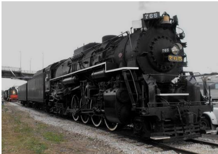
Above: Nickel Plate #765 Locomotive between tours

by Dale Wilken (article and all photo credit)