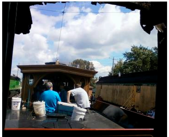
Above: View of the "elite seat" in tender car.

On the weekend of August 13th and 14th, the Leviathan performed run-bys across from the East Union Depot as well as made trips the entire length of the IRM Main Line. The full trips were near 12:00PM, 2:00PM and 4:00PM with the other run-bys being announced between those times.