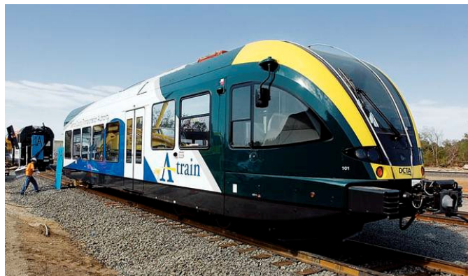
Above: Workers install an articulation bracket on one of the DCTA's new A-train cars in Lewisville. (Photo credit: DRC/AI Key)

Source: 8/13/11 Fort Worth Star-Telegram , article by Susan McFarland, at http://www.star-telegram.com/2011/08/13/3288921/old-town-merchants-all-aboard.html