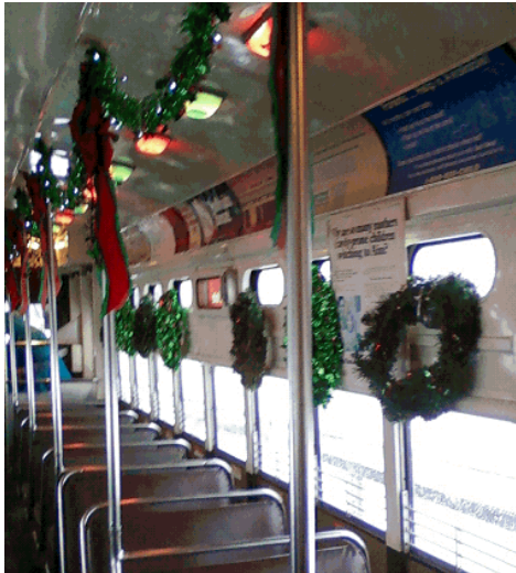
(Left) Vintage Chicago El cars decorated in their best red and green livery

Did you know that styrofoam snowballs are railroad-approved? Less fuss, less muss than the icy, chill original. How many styrofoam snowballs can you balance while riding a vintage CTA El car, last in service in 1992?