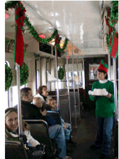
(Right) Smiling riders on the Holiday Railway

(Photo credit above: a nice family on the train)