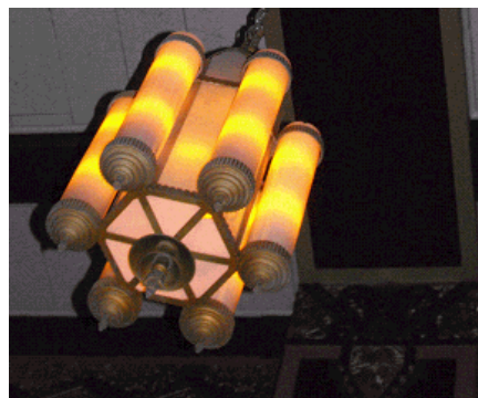
(Above) Example of renovations done in the T&P restaurant area