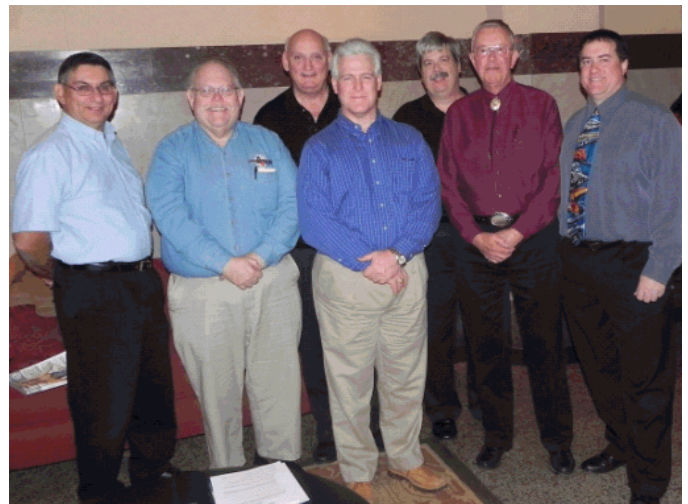
(Above right) The 2010 Chapter officers greet all with holiday cheer at the T&P dinner.