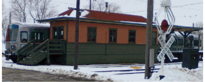
(Right) Not quite your typical urban station, but the snow makes it all true to Chicago in style.

Did you know that styrofoam snowballs are railroad-approved? Less fuss, less muss than the icy, chill original. How many styrofoam snowballs can you balance while riding a vintage CTA El car, last in service in 1992?