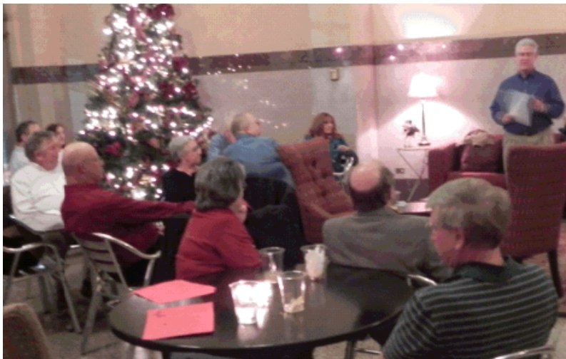
(Above left) Chapter members meet in the festive ambience of the Texas & Pacific station, Fort Worth.

The North Texas Chapter held its annual Christmas dinner on December 8 in the renovated Texas & Pacific depot in downtown Fort Worth. Some 42 members and guests gathered to visit, eat and view the renovations. This has become a favored spot for receptions and dinners in a historic setting. The T&P depot is also the site of the chapter sponsored opening reception for Lone Star Rails , the 2008 national NRHS convention.