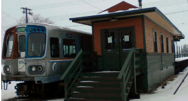
(Left) IRM showcases former CTA cars on the museum's electric line on a snowy afternoon

Welcome to the Happy Holiday Train at the Illinois Railway Museum (IRM) ! Quick, come in out of the cold and board the Holiday Train scheduled to depart Saturday and Sunday afternoons, on the hour.