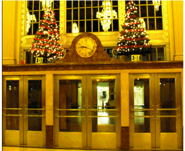
(Above left and far right) Scenes in the main waiting room of the T&P depot.