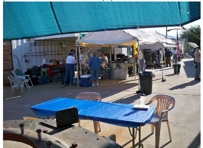
Above right: All were welcome at the open house.