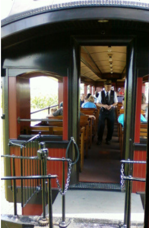
(Bottom left) Conductor greets everyone in the open coach.

For more details on the Strasburg Railroad, see http://strasburgrailroad.com/