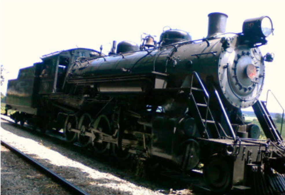
(Top left) Locomotive 90 in her best shining black livery, awaiting the day's operations.