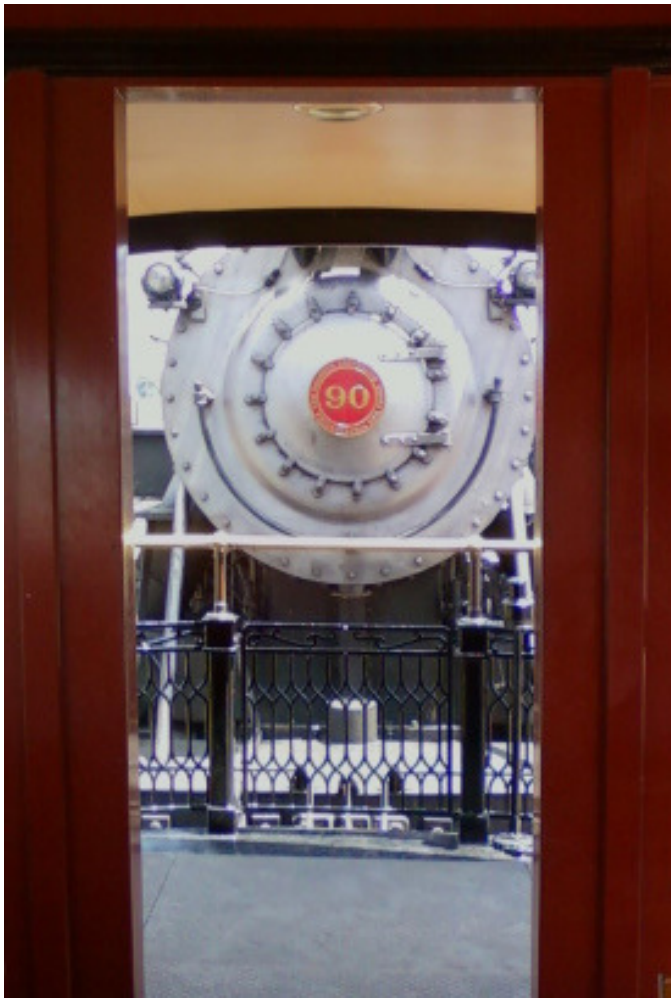
(Top left) A peek at Locomotive 90.