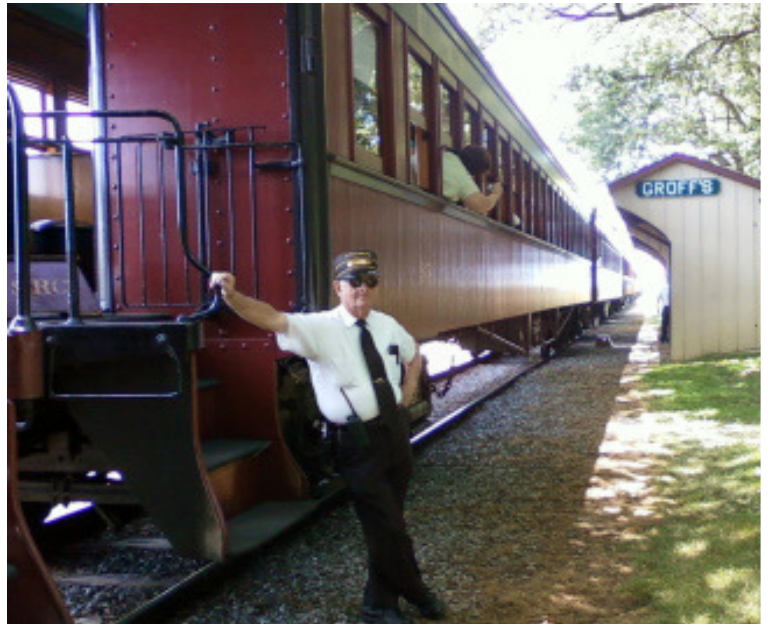
(Top right) Waiting out the picnic stop at Groove's grove.