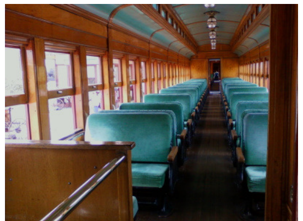
(Bottom right) Clerestory windows, vintage lamps, lovely woodworking and comfy seats welcome all to a lovely ride.