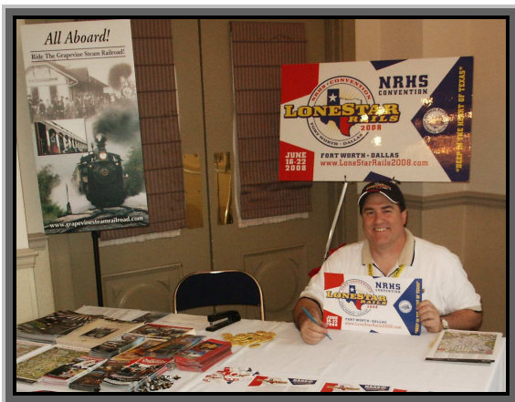
LSR 2008 Chair Skip at information table

Here’s how LSR 2008 pre-registration events unfolded, reported “live” from Chattanooga at the Lone Star Rails information desk (below.)