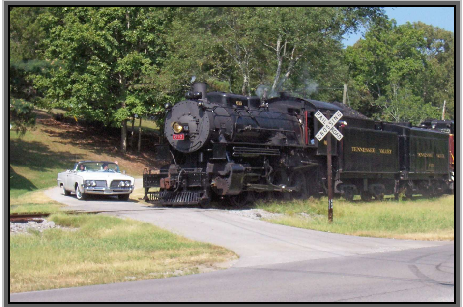
A bright blue sky, the Tennessee Valley No 610 (2-6-0 Consolidated), a vintage automobile, out for a country ride – a good time was definitely had by all.