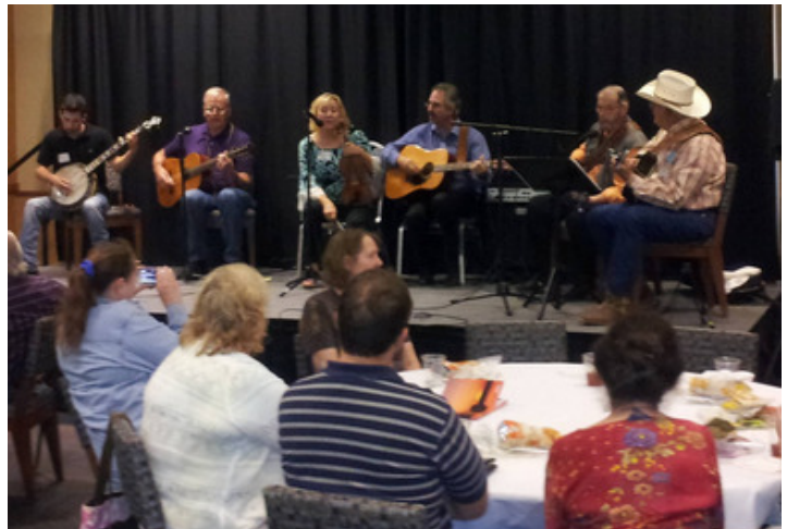
Live band played during the Luncheon.