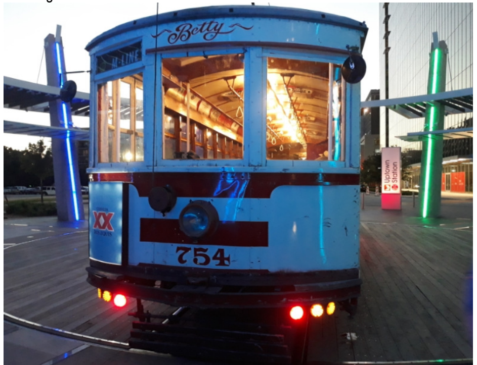
Above: "Betty" MATA Car 754.