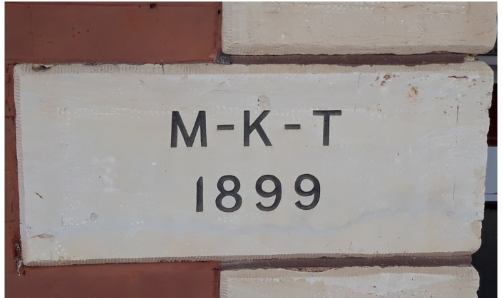
Right: Cornerstone of Belton KATY station. Belton, Texas