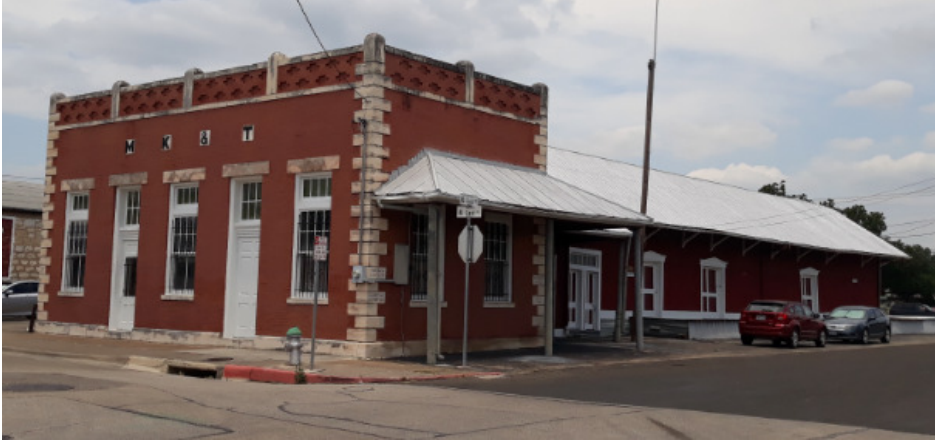
Left: KATY passenger and freight station. Belton, Texas.