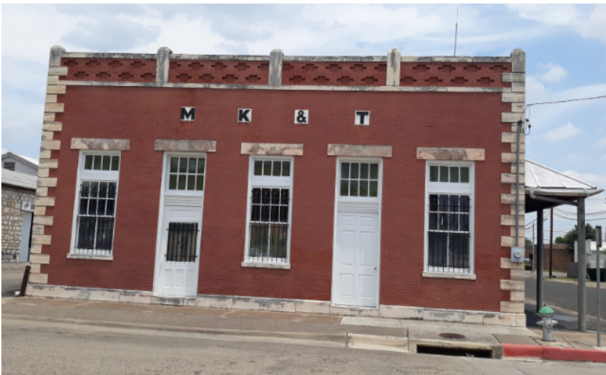
Left: KATY passenger station Belton, Texas.