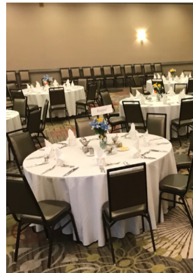
Right: Elegant banquet ambience ready for convention members.