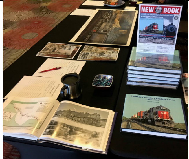
Right: Railroad history books and artwork provided colorful memories for visitors to buy and take home.