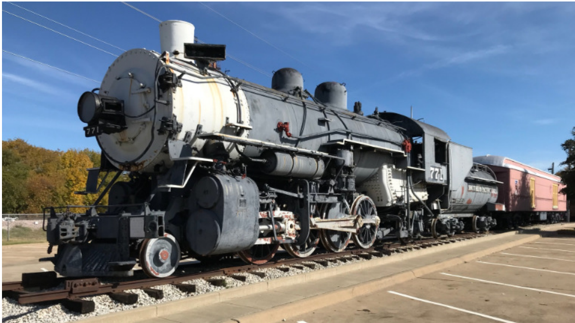
Above: Grapevine rails on display.