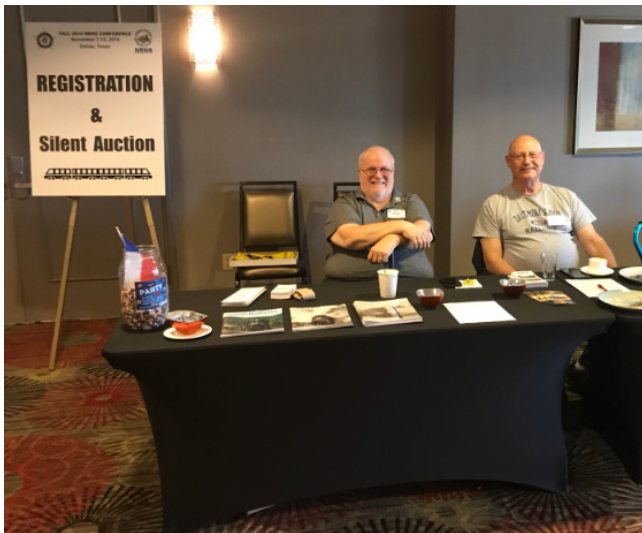
Left: A pair of friendly North Texas Chapter members welcome everyone to Dallas.